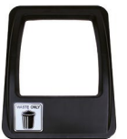
Waste (black, royal blue, dark green, yellow, executive grey)