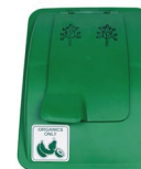
Lift Lid Vented (green)