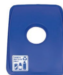
Cans/Bottles (royal blue, dark green, executive grey)

VARIETY OF LIDS AVAILABLE IN MANY COLORS