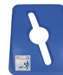
Mixed (royal blue, dark green, executive grey)