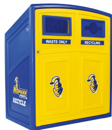
CUSTOMIZE WITH YOUR COLORS/LOGOS