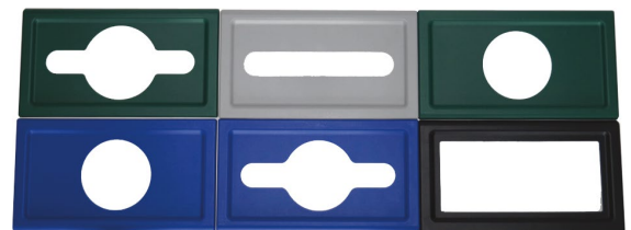
VARIETY OF LID OPENINGS & STAMPING OPTIONS