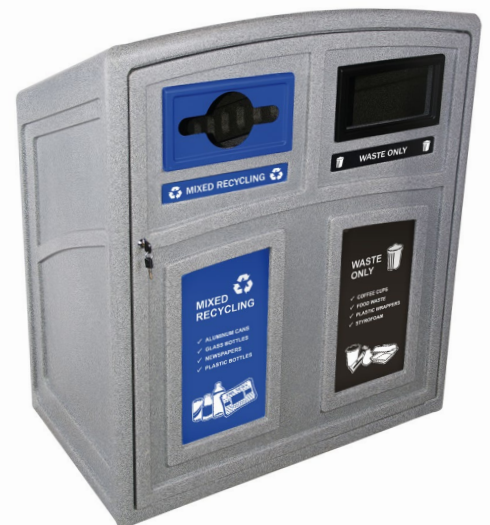
Optional labels available