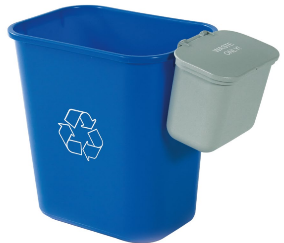
Shown holding the Hanging Waste Basket (BC1500)