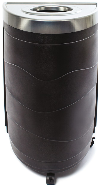
*Shown with the Optional Wheel Caster Kit

Recycling 1,000 tons of glass creates slightly over 8 jobs