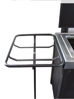
LUNCH TRAY KIT