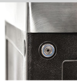
MAGNETIC CONNECTION KIT