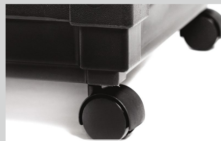
WHEEL CASTER KIT