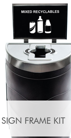
SIGN FRAME KIT