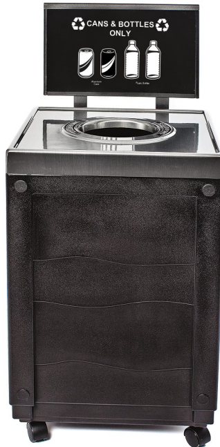
*Shown with the Optional Wheel Caster Kit and Sign Frame Kit

Glass that is thrown away & ends up in landfills will never decompose.