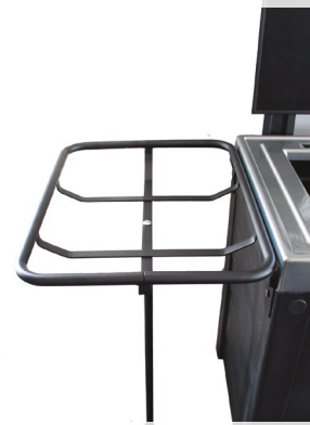
LUNCH TRAY KIT