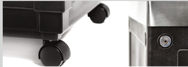
WHEEL CASTER KIT