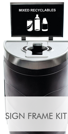
SIGN FRAME KIT