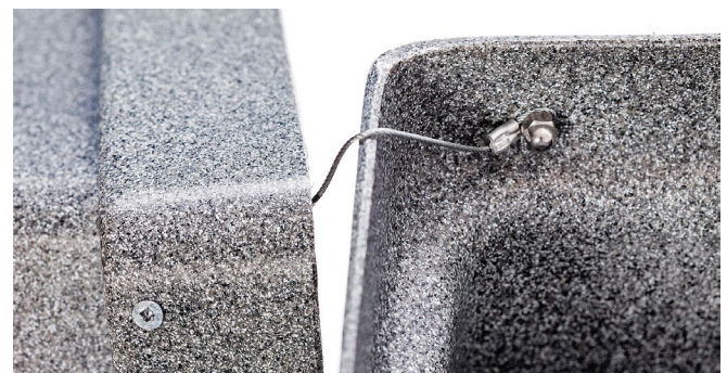
LIDS TETHERED TO BODY ON OUTDOOR UNITS *SOME ASSEMBLY REQUIRED