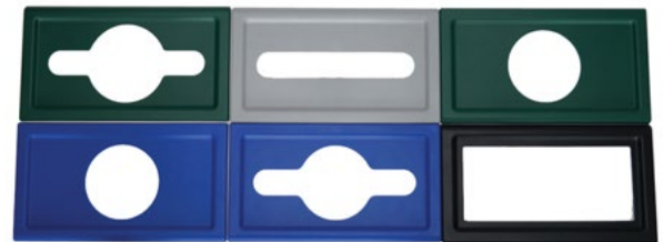
VARIETY OF LID OPENING & STAMPING OPTIONS