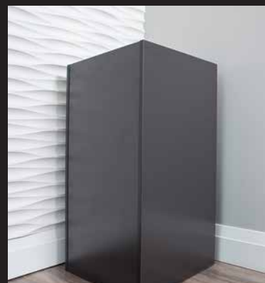
Strong Composite Board Design