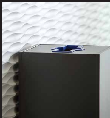
Multiple Opening Options