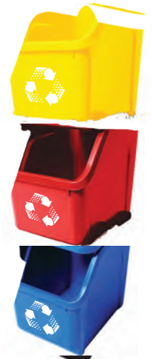
Great for stacking, creating a recycling centre