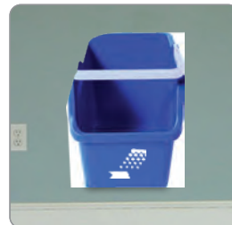
Wall mount allows for easy storage

Made with a minimum of 35% recycled content