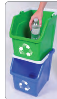
Holds 6 gallons of recyclables