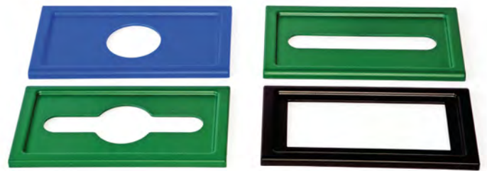
VARIETY OF LID OPENINGS & STAMPING OPTIONS