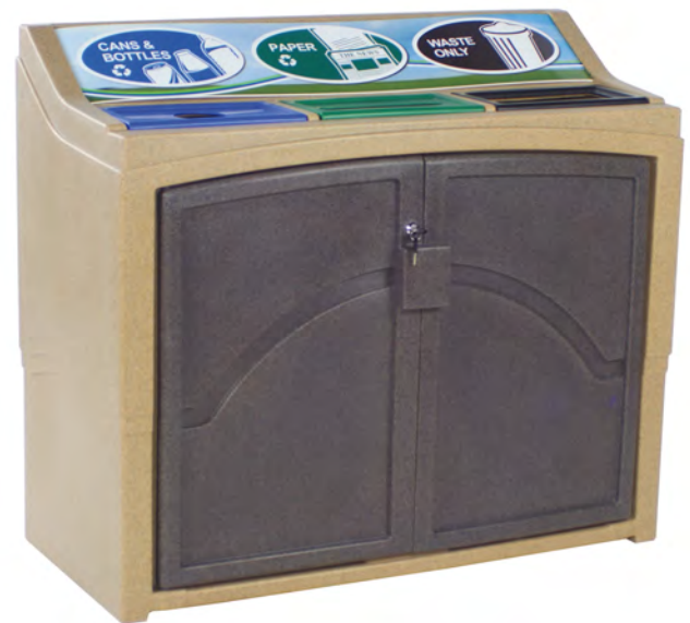
*Custom model shown